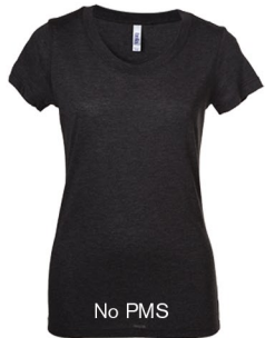
CHARCOAL BLACK TRIBLEND

Textile fabric colours are subject to dye lot variation and will not be exact match to print pantone reference