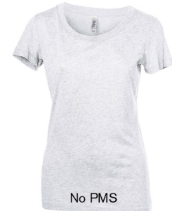
WHITE FLECK TRIBLEND