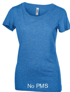
TRUE ROYAL TRIBLEND