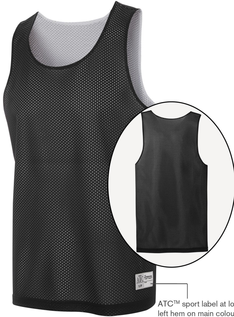
ATC™ sport label at lower left hem on main colour side